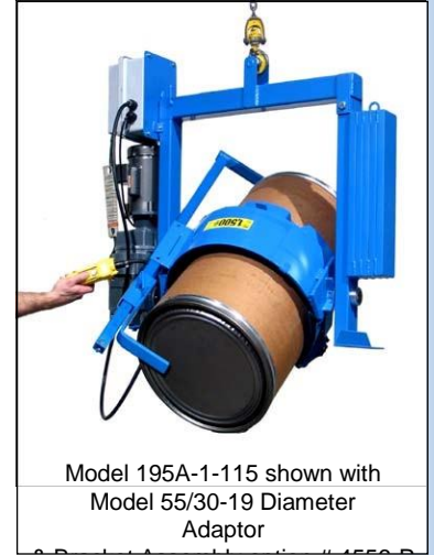
Model 195A-1-115 shown with Model 55/30-19 Diameter Adaptor