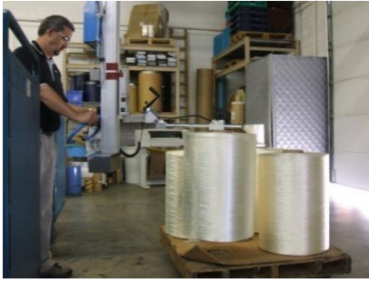
Roll Handling-Expand-O-Turn® Core Vertical to Cores Horizontal