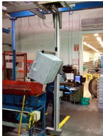
Tote Dumping into Hopper