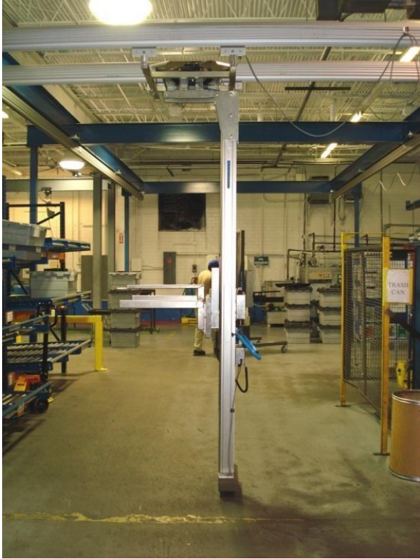
Clear Floor-No Obstructions

The Lift-N-Glide™ is a marriage between two systems the Movomech® Rail System and the Lift-O-Flex® Ergonomic Lifter w/End-effectors. This marriage offers diverse load handling characteristics for mid-weight and heavy-weight load capacities. The Lift-N-Glide™ has a lift capacity of up to 500-lbs. and offers RonI expanded flexibility in equipment selection to better fill your ergonomic lifting requirements.