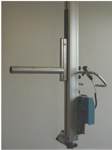
Core Probe Horizontal to Horizontal Roll Handling