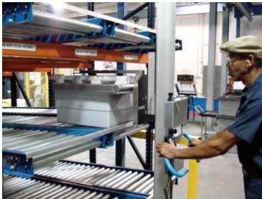
Flow Rack and Pallet Interface