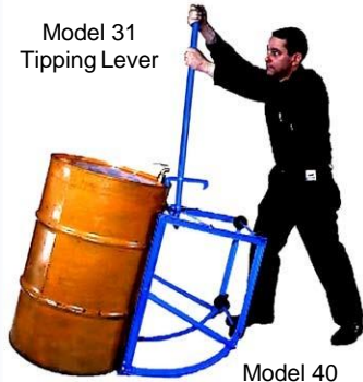
Model 40 Drum Cradle