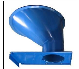
Asymmetric Drum Cone with slide gate valve to start and stop material flow. Also available with iris valve.

An Asymmetric Drum Cone can be used with many standard Morse models, including below-hook drum karriers, that lack sufficient clearance within the frame for a 45° or 60° drum cone.