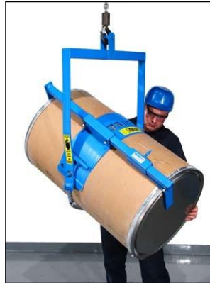
Bracket Assembly Option installed on model 85i