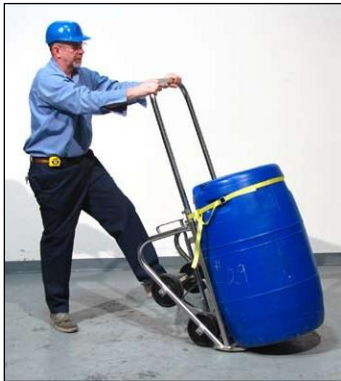
Strap assists in pulling your drum over onto the drum truck.