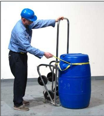
Secure optional strap (shown on model 160-SS) around a rimless drum.