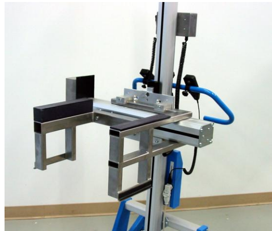
Electric Actuated Gripper Unloaded