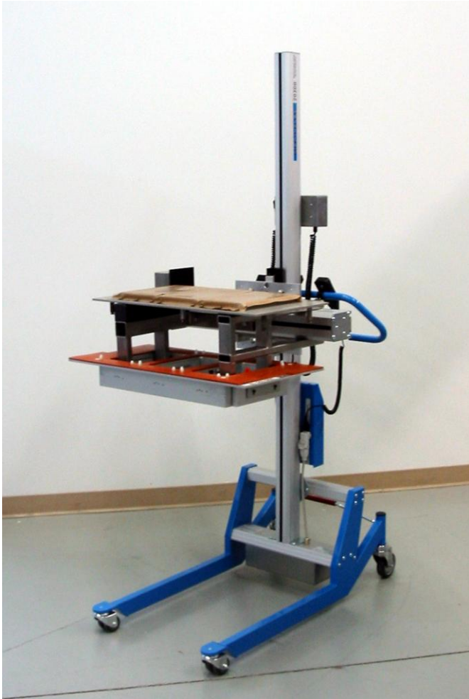
Lifter Shown with Components Loaded for Transport