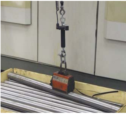
Magnetic Lifting Bar Stock