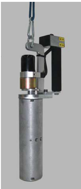
Roll Handling Electric Expand Vertical Lift/Lower