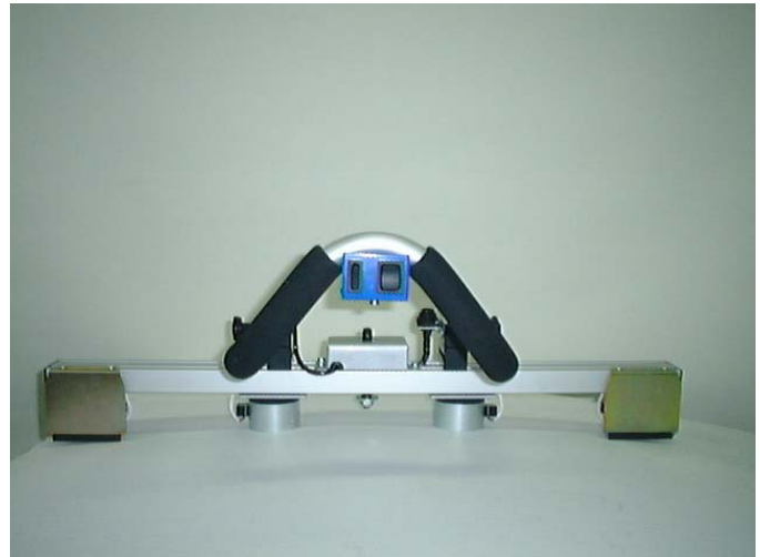
Magnetic Lifting Sheet Stock