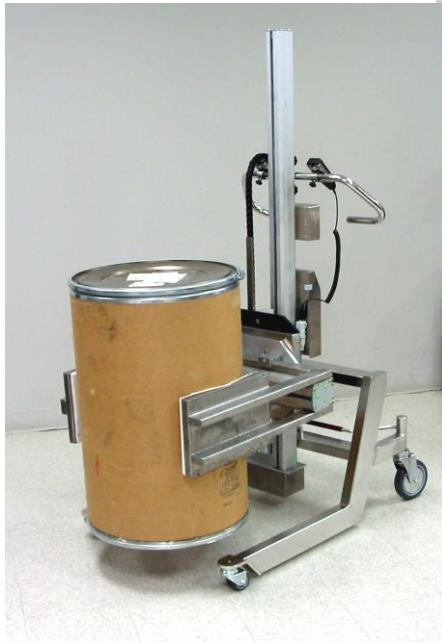
Fiber Drum Handling