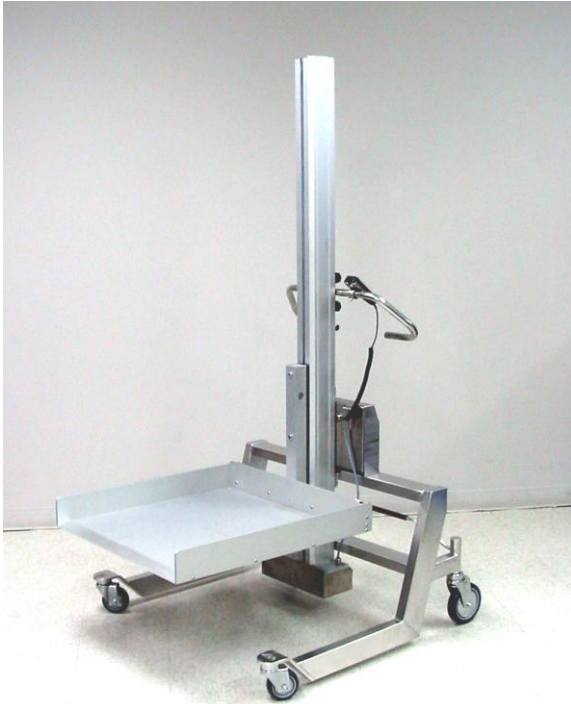
Custom Load Platform