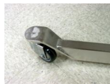
Front Castor Mounting