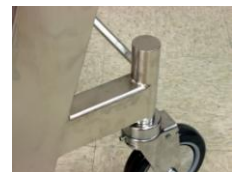
Rear Castor Post