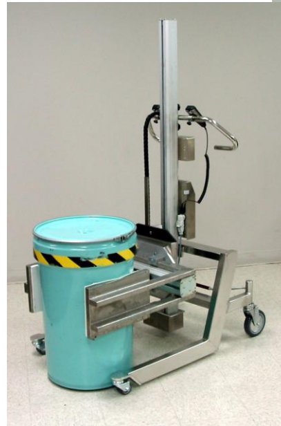
Metal Drum Handling